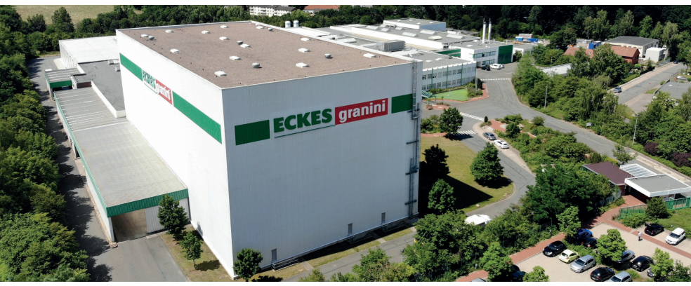
The production sites in Bad Fallingbostel