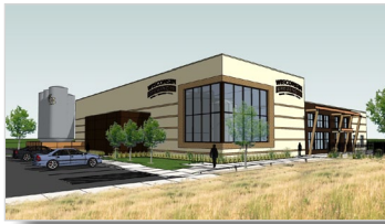
The new plant in Verona, Wisconsin/USA.

The Wisconsin Brewing Company is building Wisconsin's newest craft brewery in Verona, Wisconsin/USA. The new production plant, which is currently under construction, combines old world, artisan craftsmanship and state-of-the-art brewing technology. The new brewhouse, built by GEA Process Engineering USA will be capable of producing in excess of 100,000 barrels of Wisconsin craft beer annually. End of March this year, ProLeiT received the order from GEA USA to automate the new brewhouse. Construction updates, photos and a weekly video are available at