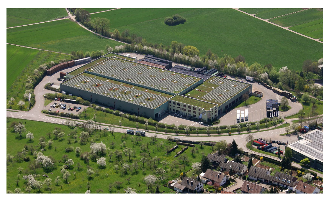
Aerial view of the plant

Magazine: Flüssiges Obst Published: 09/2021