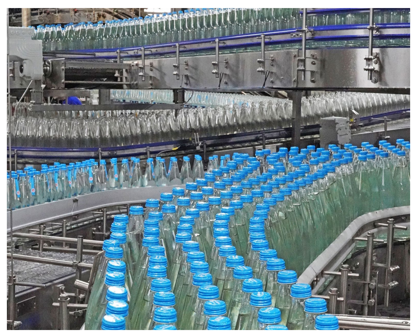
Production at Ensinger