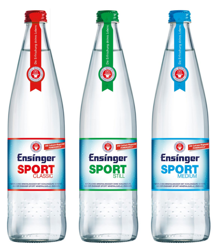
Ensinger product portfolio

In return, the subordinate systems from the syrup room still deliver corresponding raw material consumption data as well as produced quantities to the MES. Along the entire value chain, the MES analyzes all downtime periods, line conditions and production data and summarizes them in an overview based on OEE (overall equipment effectiveness). When explaining a decisive advantage, Stefan Ruff says: "Since all data are maintained at a central location in the ERP system and transferred from there to the subsystems, isolated solutions cannot arise. Deviating master data at the facility are thus a thing of the past."