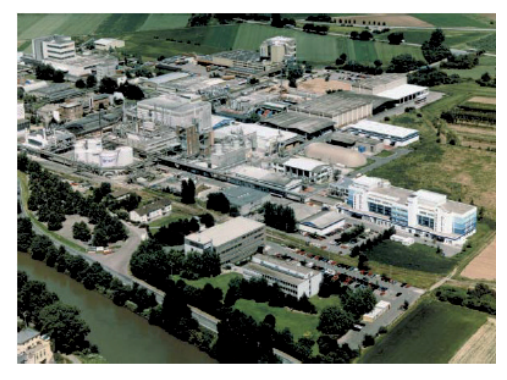
Bird's eye view of the production location in Ladenburg/Germany.

At its Ladenburg production location, BK Giulini has recently converted the recipe-controlled process automation of its centralized mixing plant to the new Plant iT version. Consistently process-oriented materials management organized as a centralized module provides the basis for highly flexible mixing process sequences and thus enables the company to rapidly adjust to varied material specifications. In addition, the material flow acquisition ensures comprehensive batch traceability.