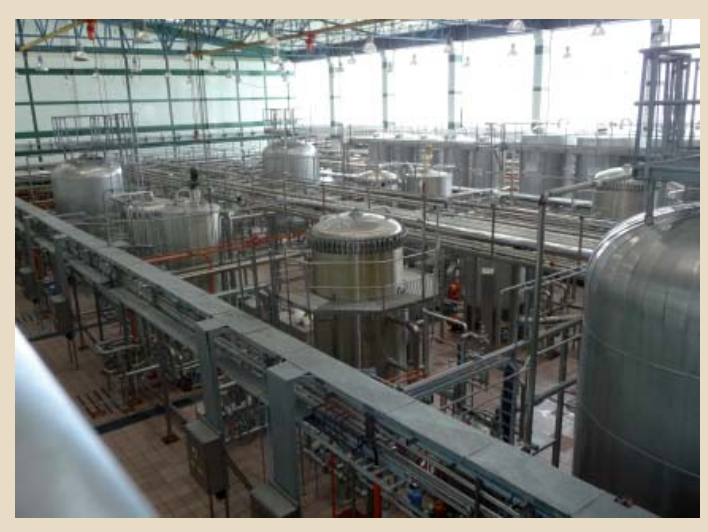
brewmaxx controlled filtration to ensure "clear beer"

software. With the contract awarded for the complete refurbishment of the Bavaria control system, the starting gun for the project was fired at the end of 2006.