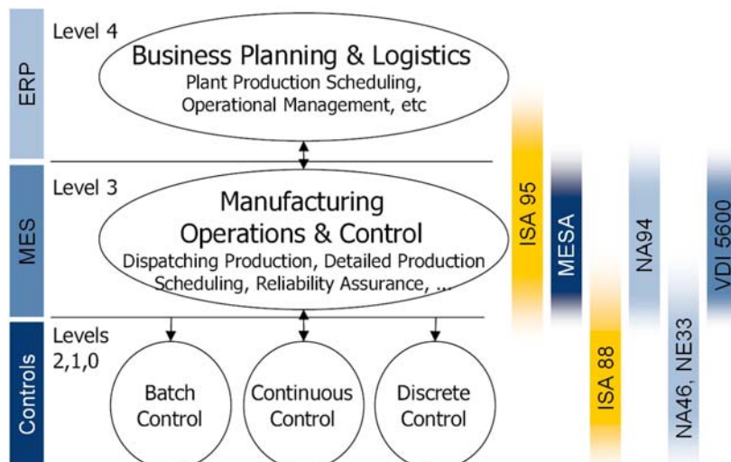
Positioning of norms and guidelines from ISA, Mesa, Namur and VDI in the ISA control hierarchy.

There is an entry in the VDI matrix for each MES function and every business process as to whether a particular MES task is relevant to a particular sub-process, resulting in the following: